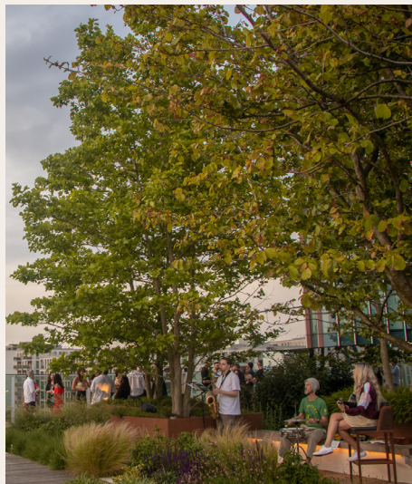
Monthly coffee mornings, residents parties, and F&B discounts

OUR LOFTS ARE AVAILABLE FOR WEEKLY, MONTHLY OR YEARLY RENTAL