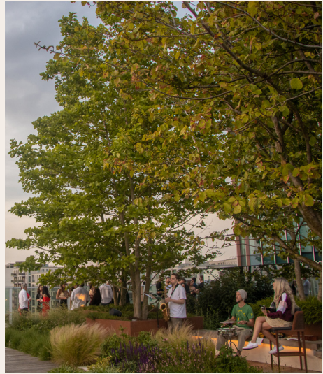
Monthly coffee mornings, residents parties, and F&B discounts

OUR LOFTS ARE AVAILABLE FOR WEEKLY, MONTHLY OR YEARLY RENTAL