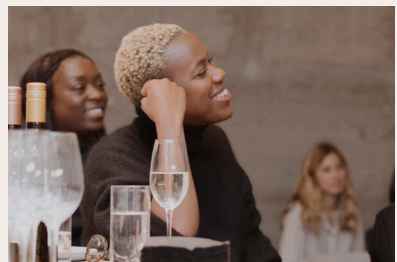
Women in Design talk in one of the Lofts